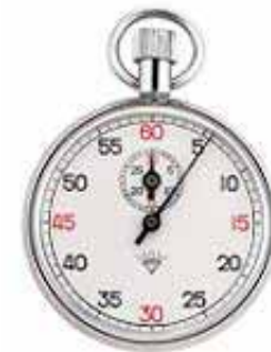
Chrome Plated Stopwatch 505 1/5 second recorder 30 seconds 60 minutes 13 jewels Case: brass, chrome plated Start/stop: crown Reset: side pusher Size: 50 x 70 x 16mm