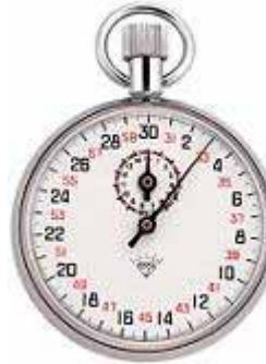
Chrome Plated Stopwatch 504 1/10 second recorder 30 seconds 15 minutes 13 jewels Case: brass, chrome plated Start/stop: crown Reset: side pusher Size: 50 x 70 x 16mm