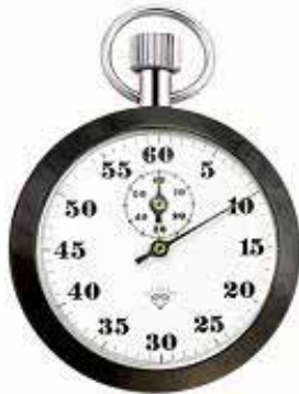
Stainless Steel Stopwatch MS96606A 1/5 seconds recorder 60 seconds 60 minutes 13 jewels Case: stainless steel Start/stop: crown Reset: side button Size: 55x77.4x14mm