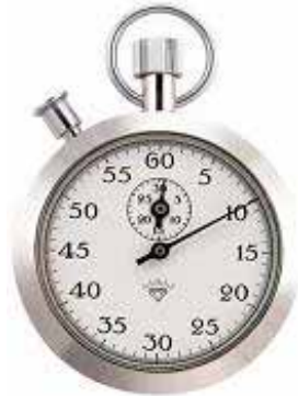
Stainless Steel Stopwatch MS86305B 1/5 seconds recorder 60 seconds 30 minutes 13 jewels Case: stainless steel Start/stop: crown Reset: side button Size: 55x77.4x14mm