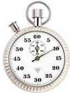
Stainless Steel Stopwatch MS86601A 1/5 seconds recorder 60 seconds 60 minutes 13 jewels Case: stainless steel Start/stop: crown Reset: side button Size: 55x77.4x14mm