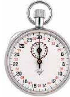
Chrome Plated Stopwatch MS503 1/10 second recorder 30 seconds 15 minutes 13 jewels Case: brass, chrome plated Start/stop: crown Reset: side pusher Size: 50 x 70 x 16mm